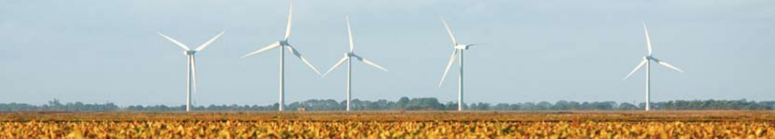
Stag's Holt Wind Farm, Cambridgeshire – for illustrative purposes only.